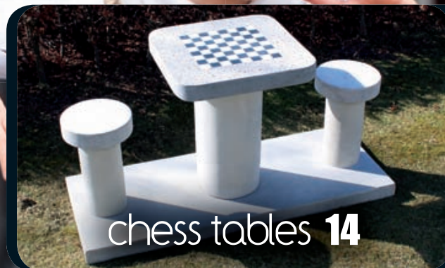
chess tables 14