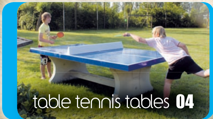
table tennis tables 04