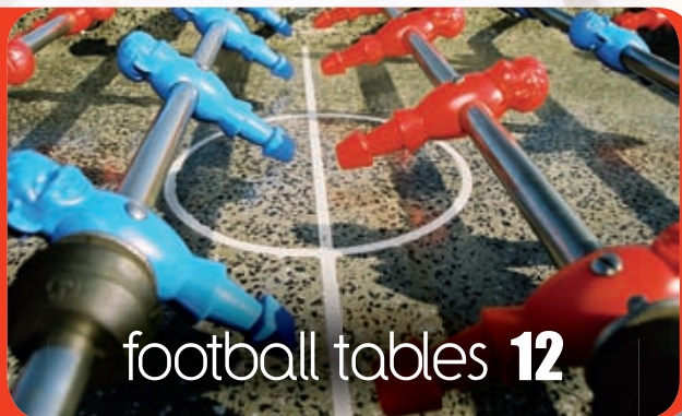
football tables 12

Redlynch Leisure is one of the UK's longest established companies in the supply and installation of outdoor leisure facilities which offer great durability and value for money. This brochure features an exciting array of Concrete Leisure Products suitable for work, leisure and pleasure all year round which will appeal to all ages and abilities.