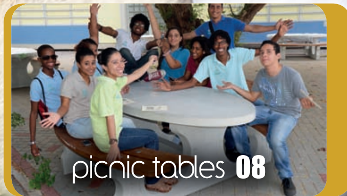
picnic tables 08